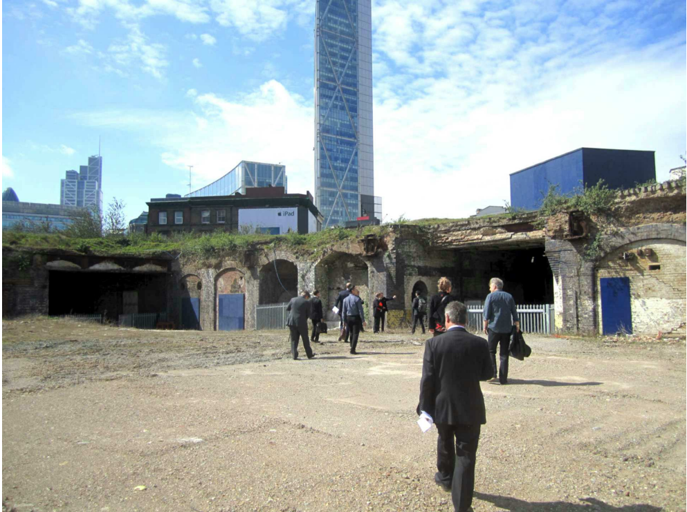
PHOTO TAKEN FROM NORTH EAST - The Oriel Gateway and adjacent arches are to be opened up to Shoreditch High St, allowing pedestrians to flow through.