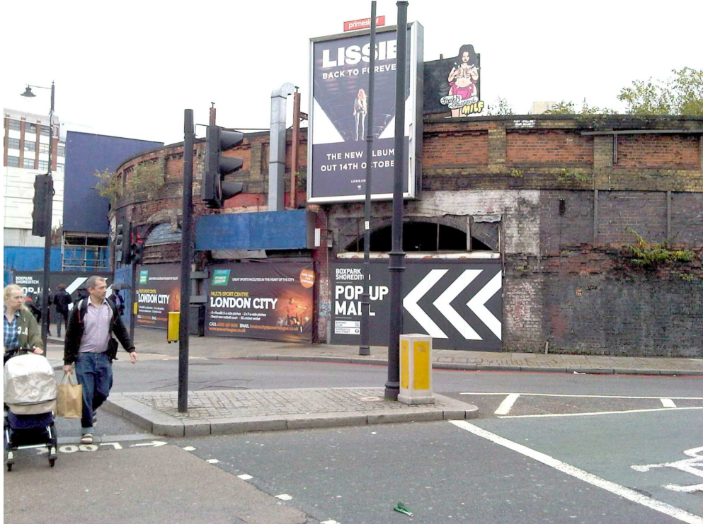
EXISTING SOUTH WEST CORNER - Brick arches are to be repaired and made good. Work include vegetation removal, repointing and replacement of badly spalled or missing bricks.